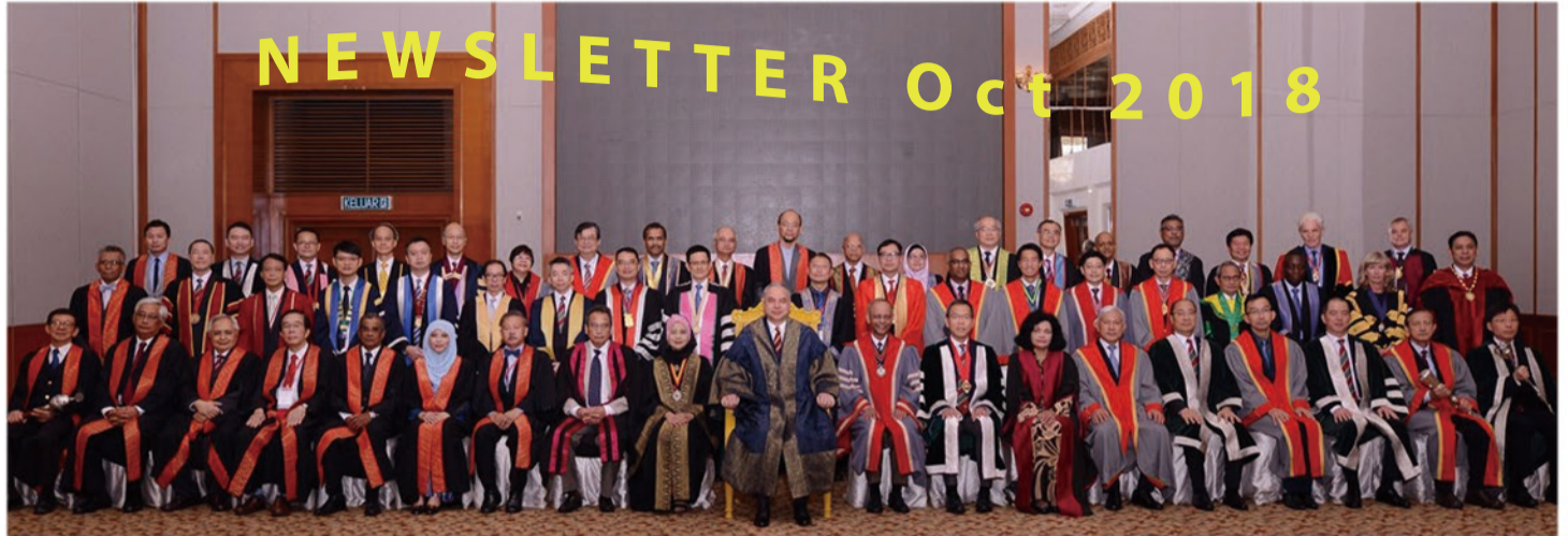
AMM-AMS-HKAM Tripartite Congress