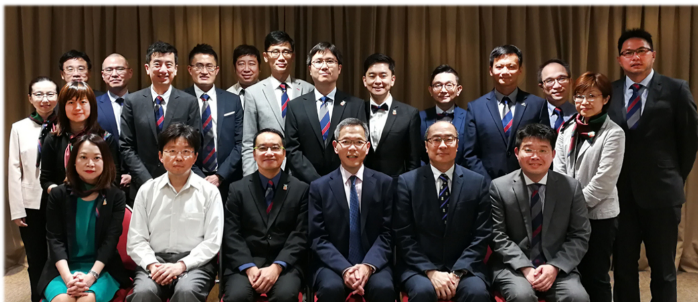
Prof Lau CS's visit to Council on 29 April 2019