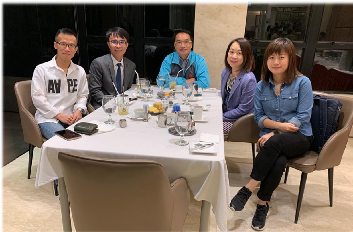
Sports team meeting with president (basketball, running, hiking teams)

Please stay tuned for upcoming events and training