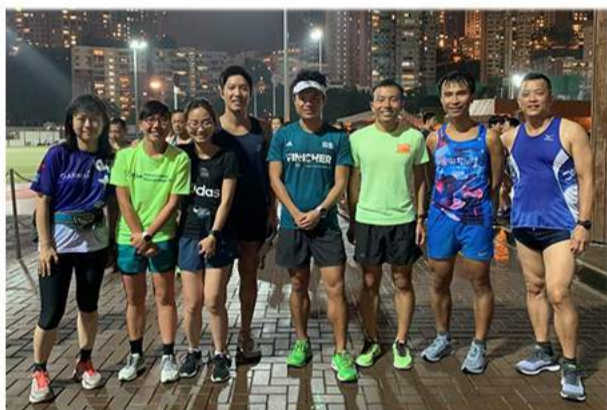
First lesson on 11 July 2019