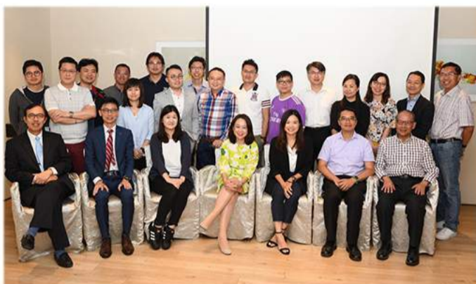
Sports Team dinner with various guests on 16 Jul 2019