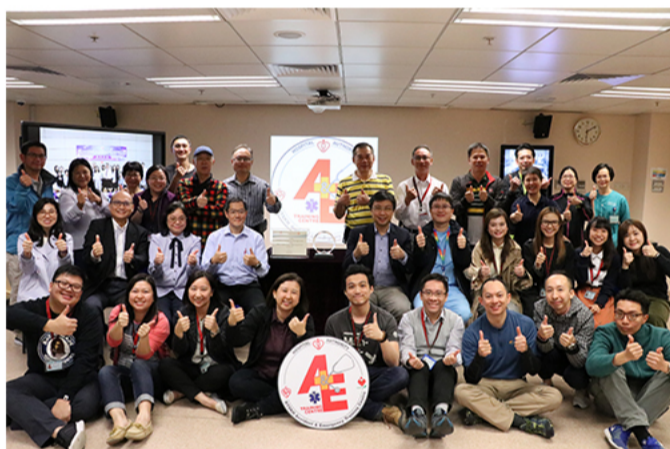
Accident and Emergency Training Centre (AETC)