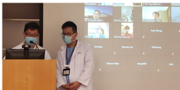
Combination of physical attendance and Zoom meeting