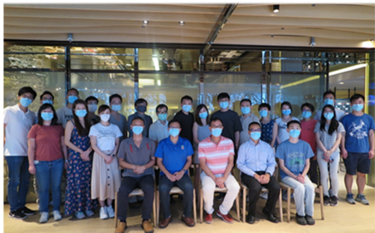
Graduation of 2019/20 Certificate Course of Clinical Toxicology