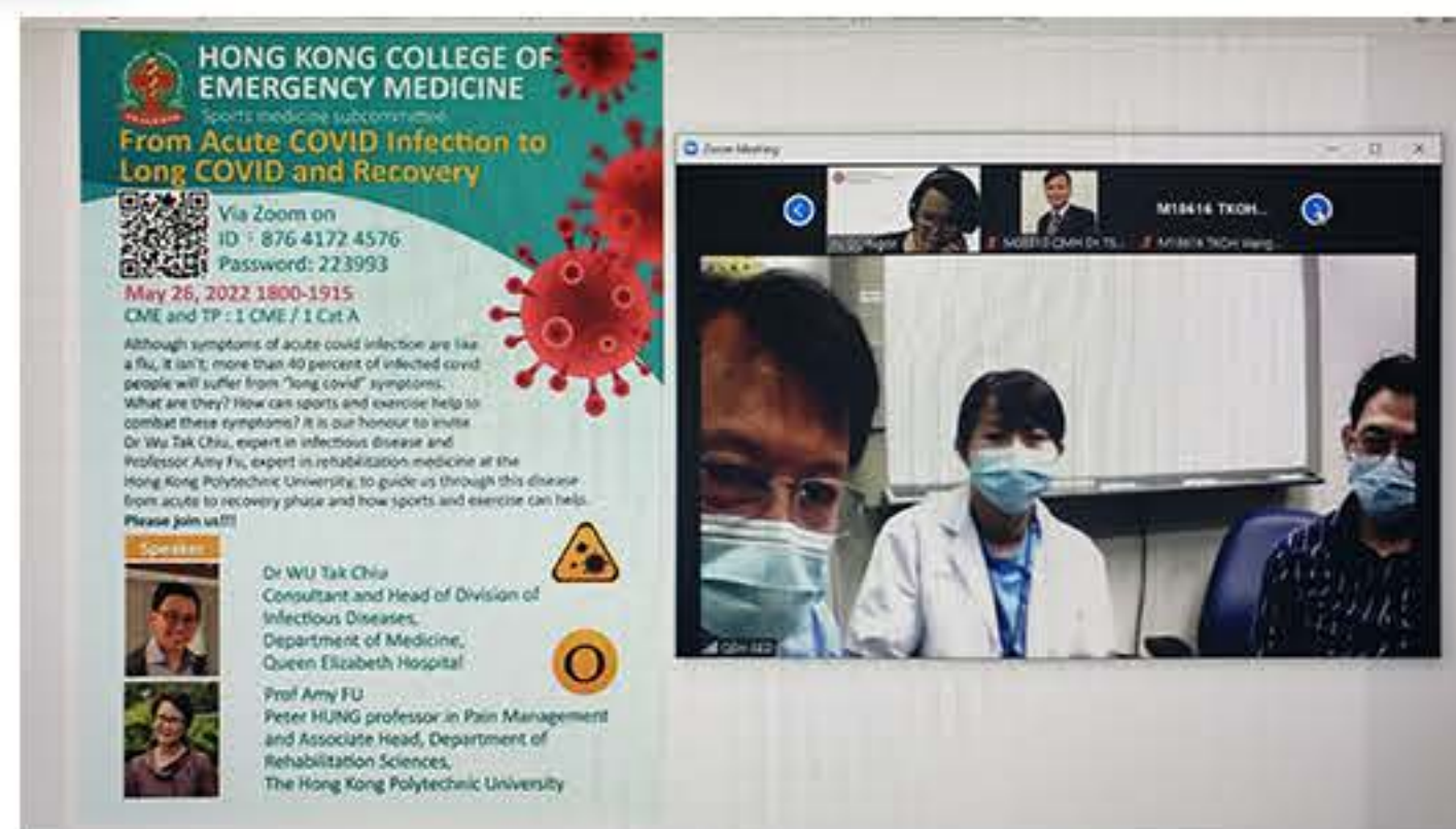
Panel discussion by moderators and speakers