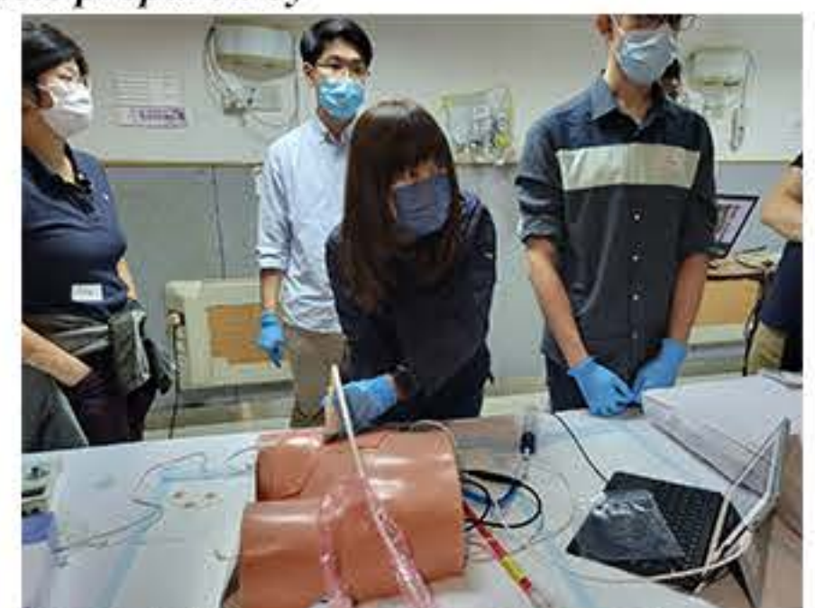
High-fidelity nerve block models prepared by instructors