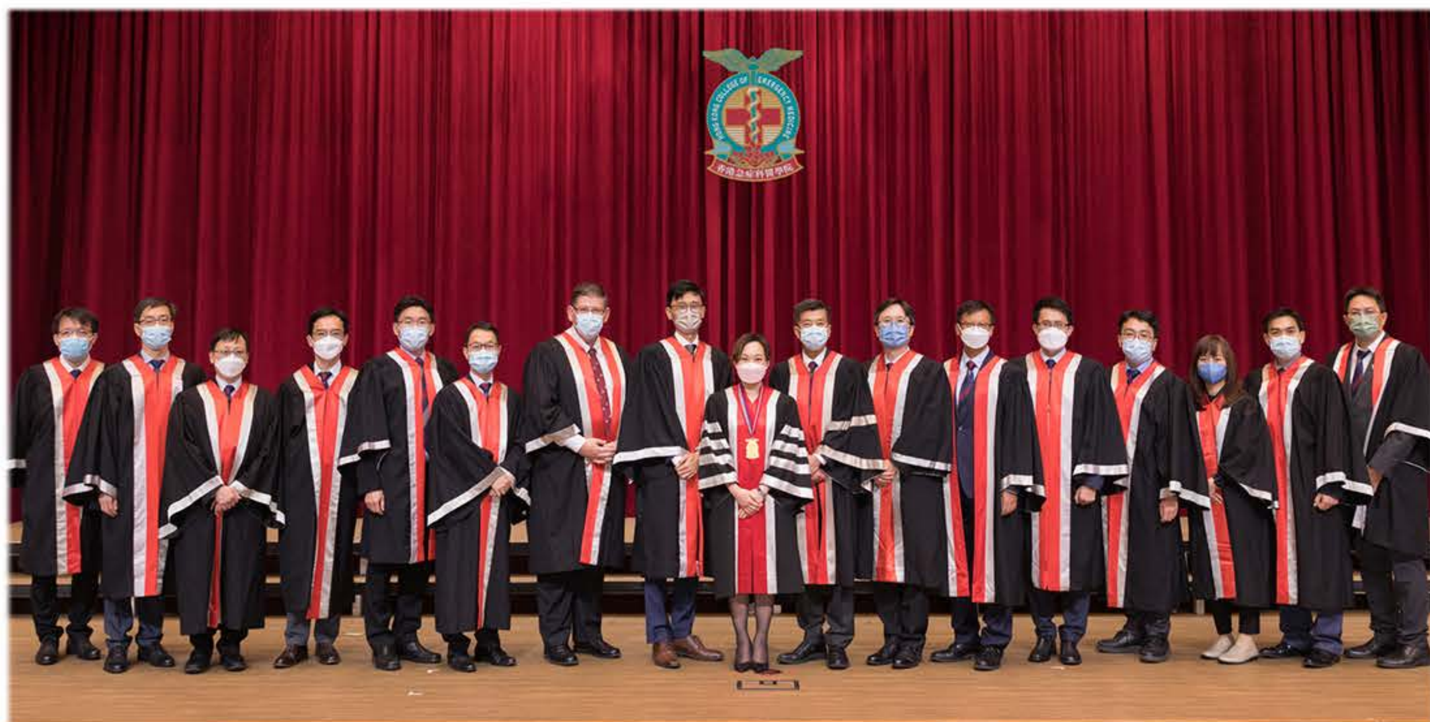
2022-2023 Council members