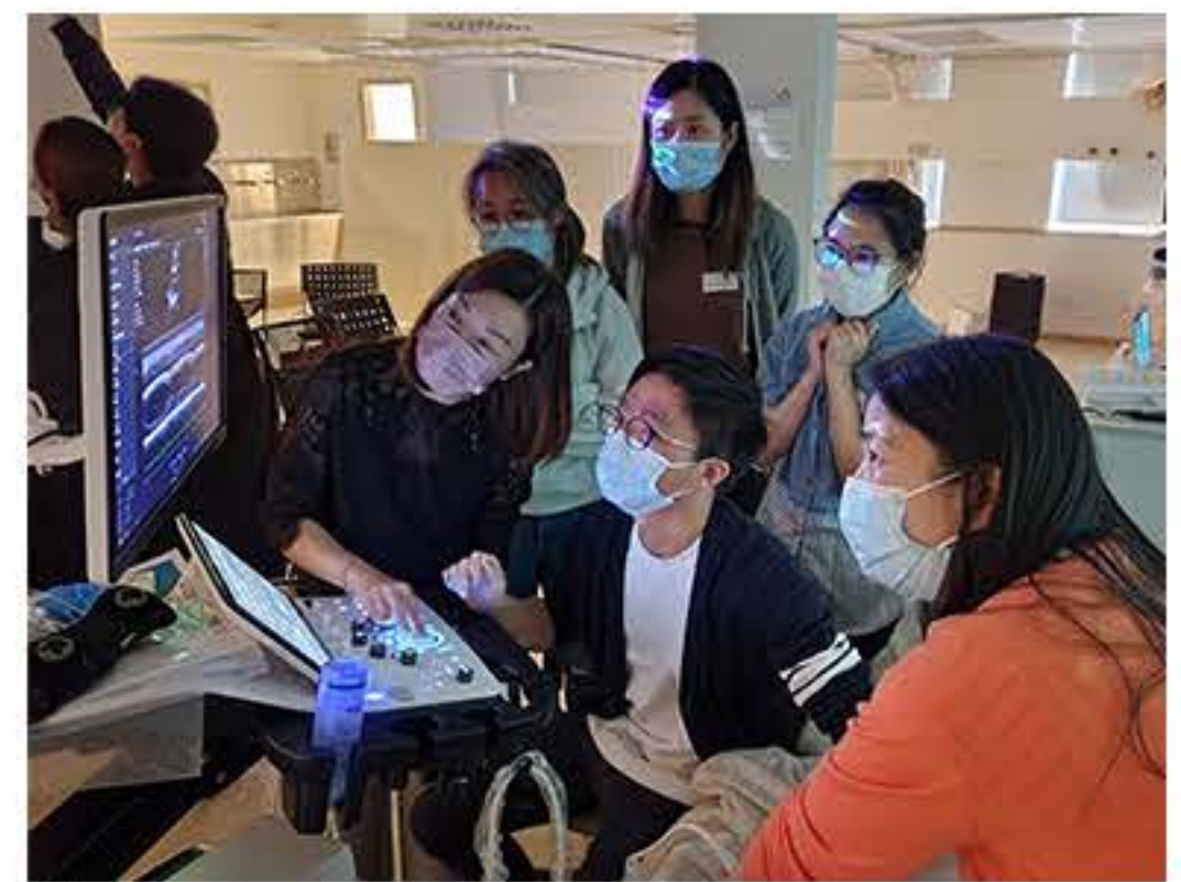
Hands-on practice by participants