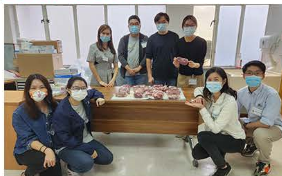
High-fidelity nerve block models prepared by instructors