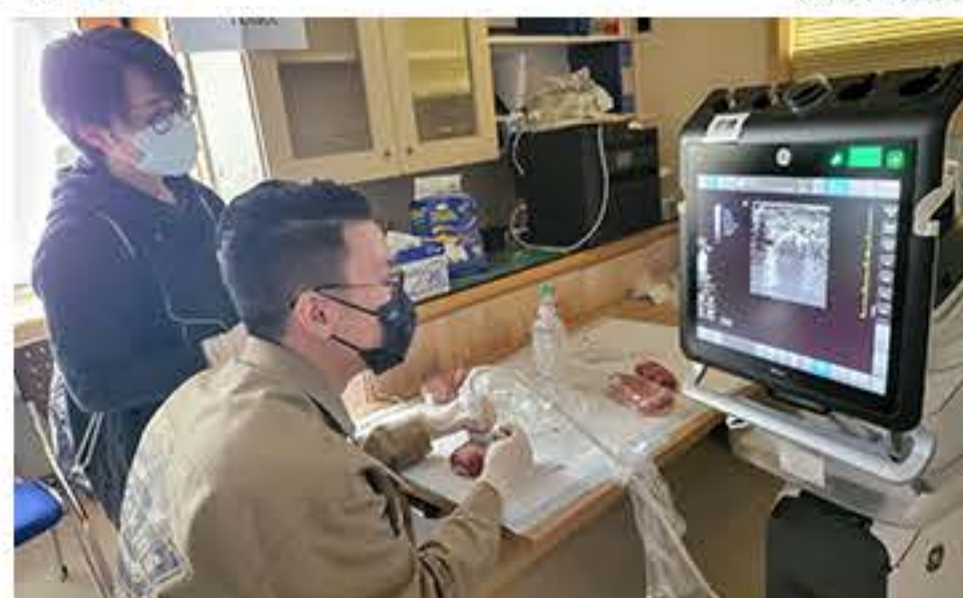
High-fidelity nerve block models prepared by instructors