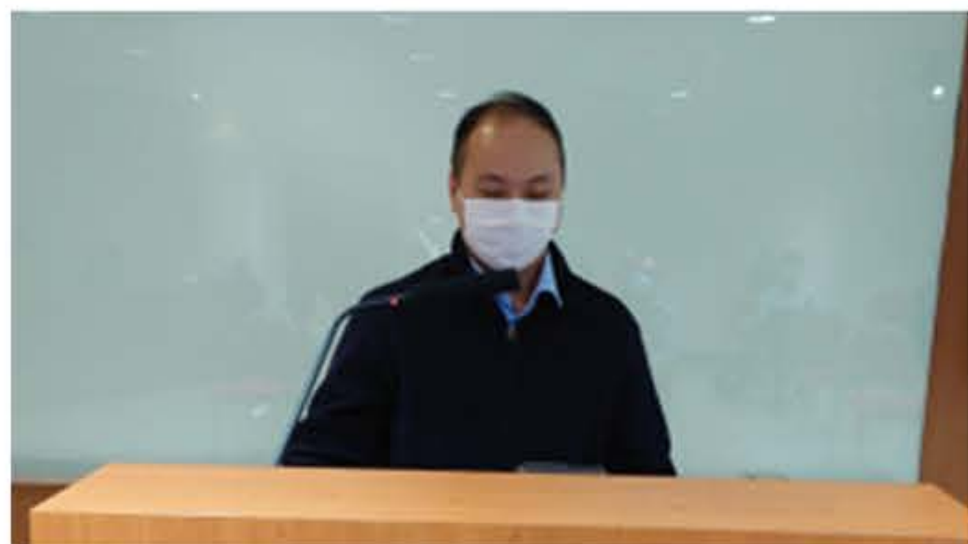
Case presentation by AED, AHNH