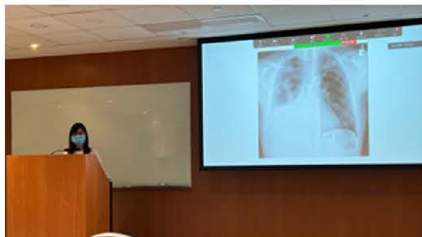
OSCE Discussion by AED, PMH