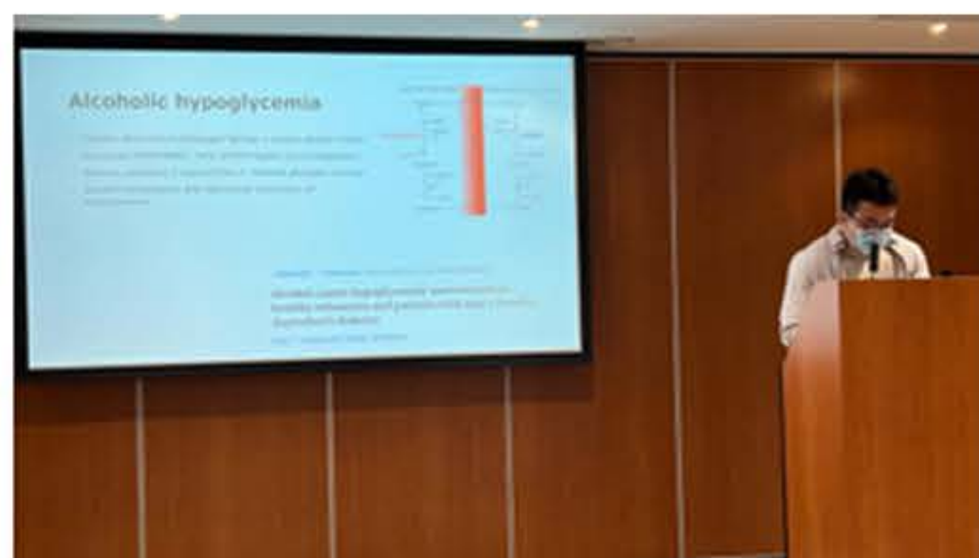
Case presentation by AED, TMH