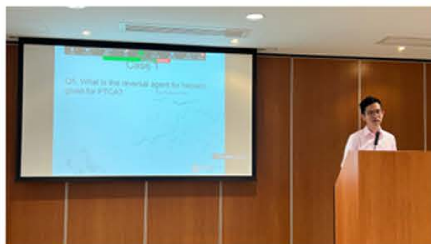
OSCE Discussion by AED, POH