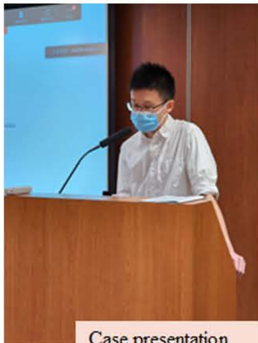
Case presentation by AED, CMC