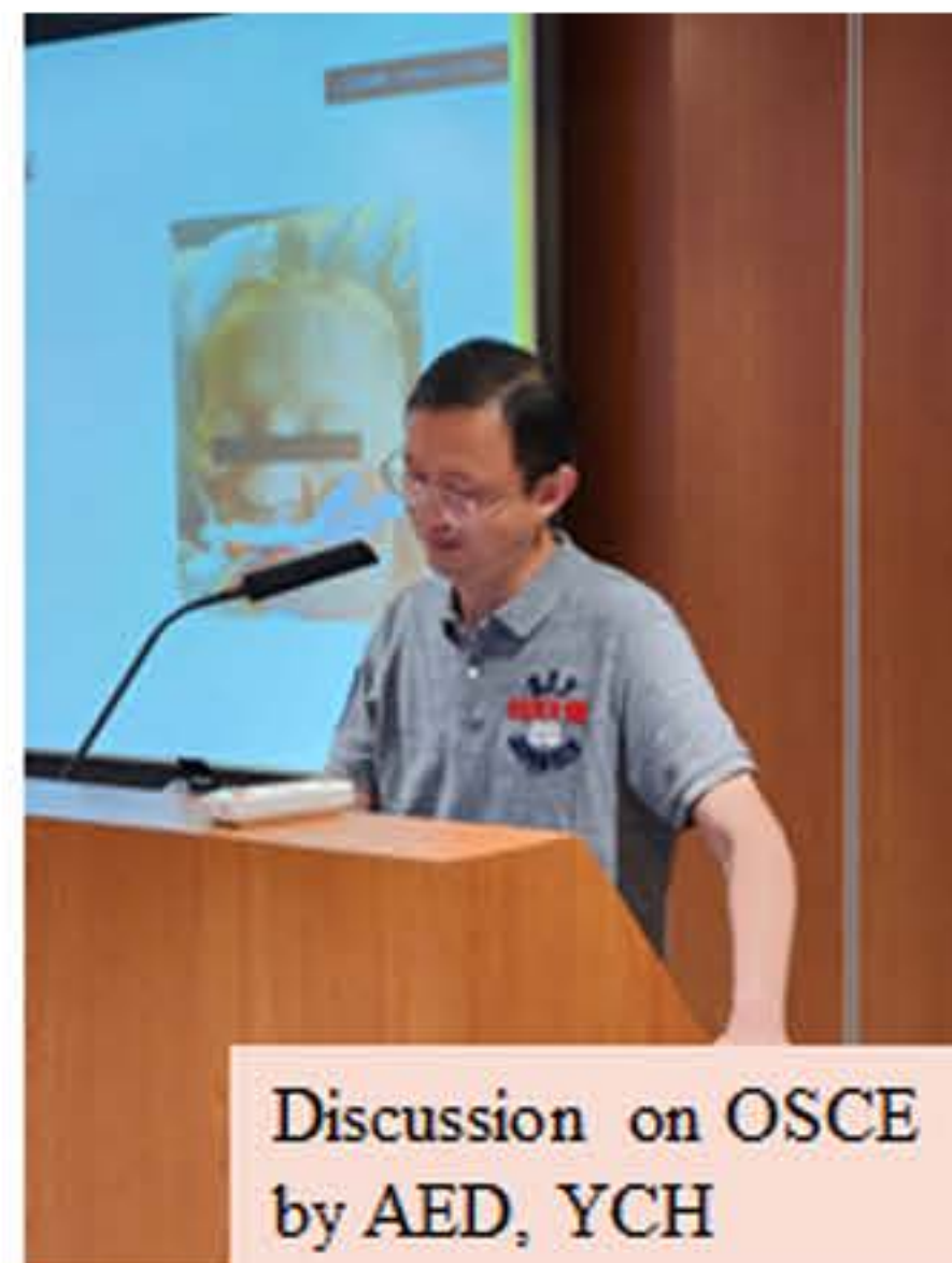
Discussion on OSCE by AED, YCH