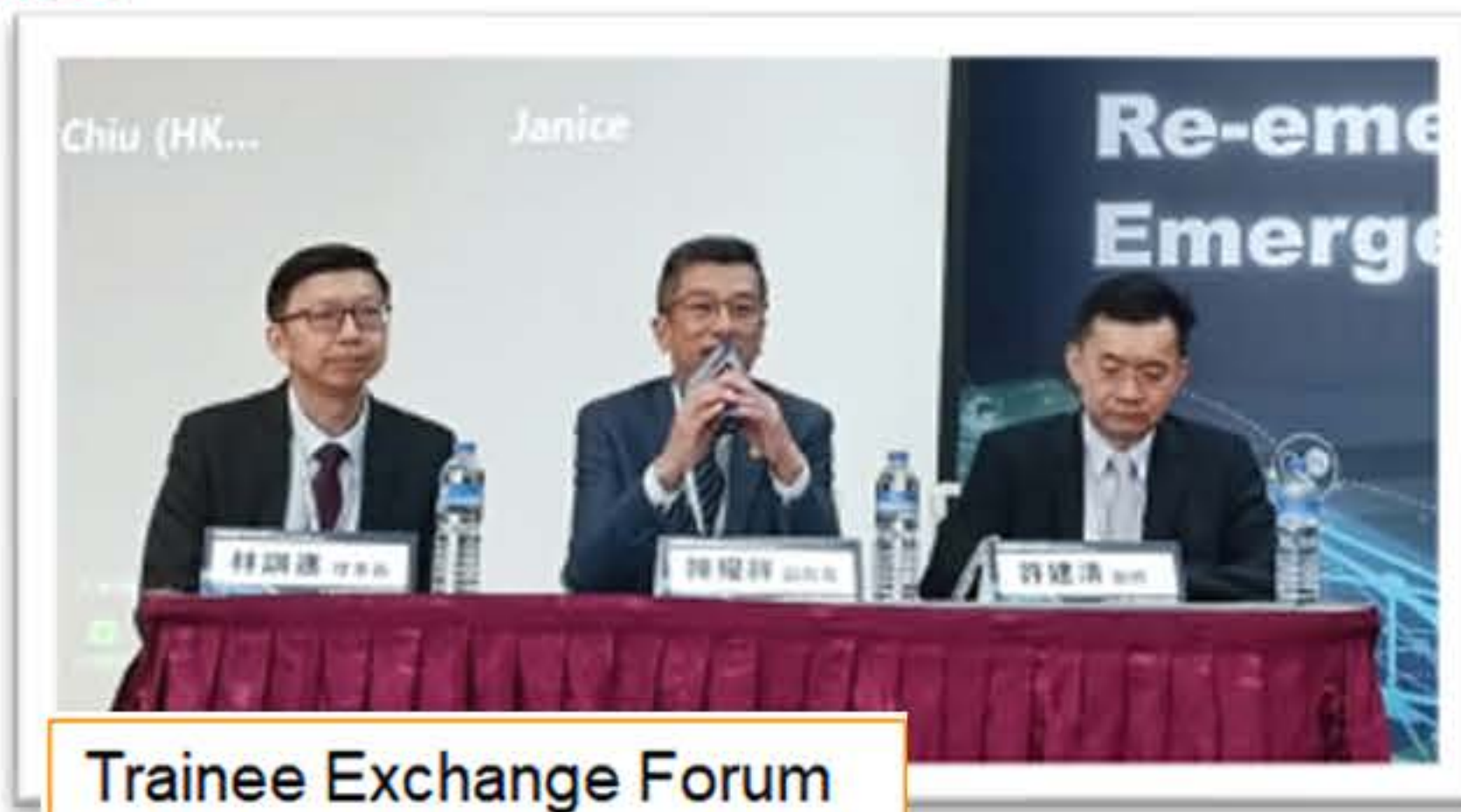
Trainee Exchange Forum