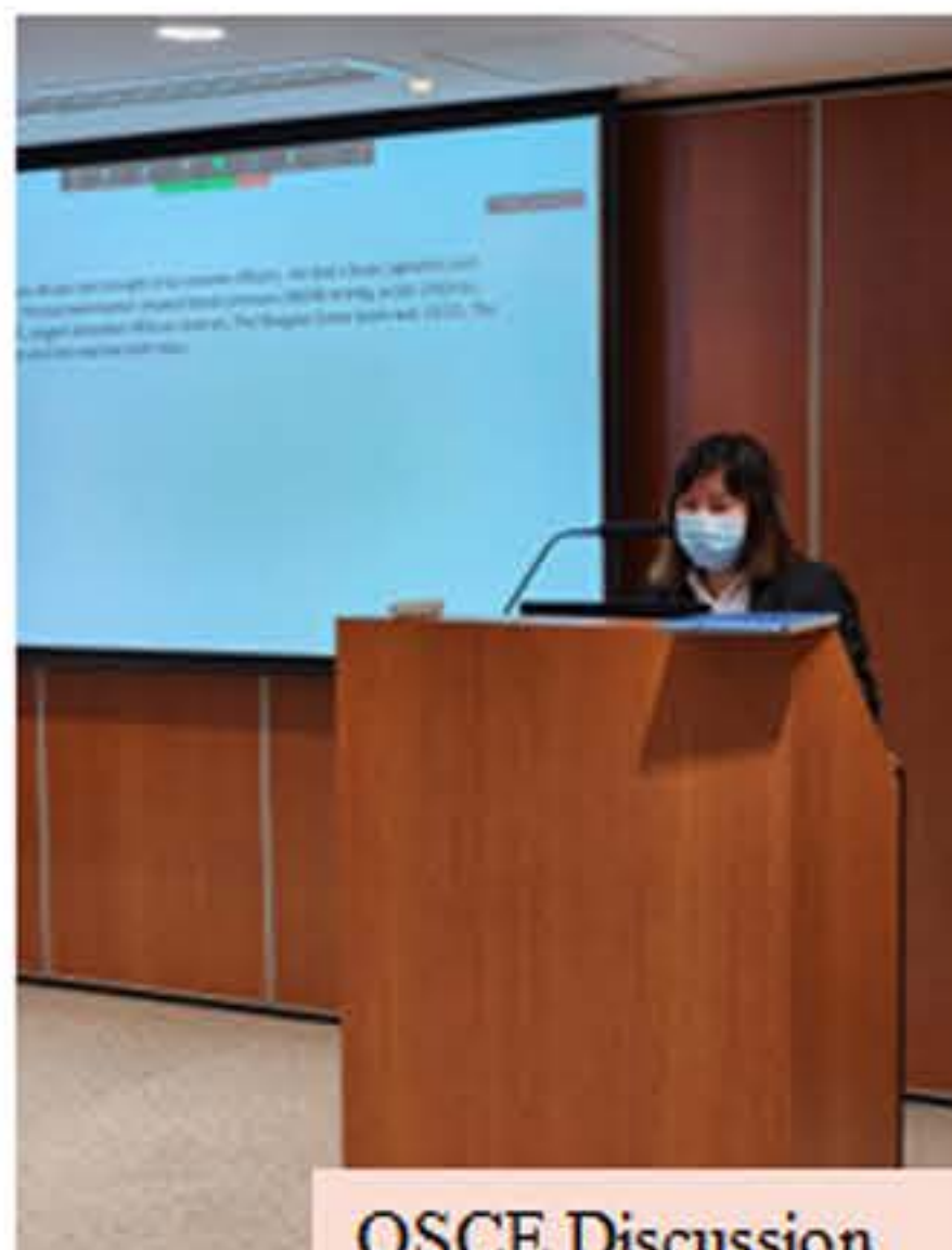
OSCE Discussion by AED, NLTH