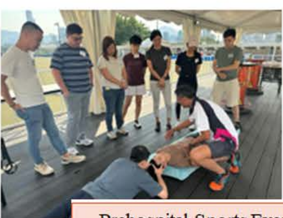
Prehospital Sports Event Medical Course