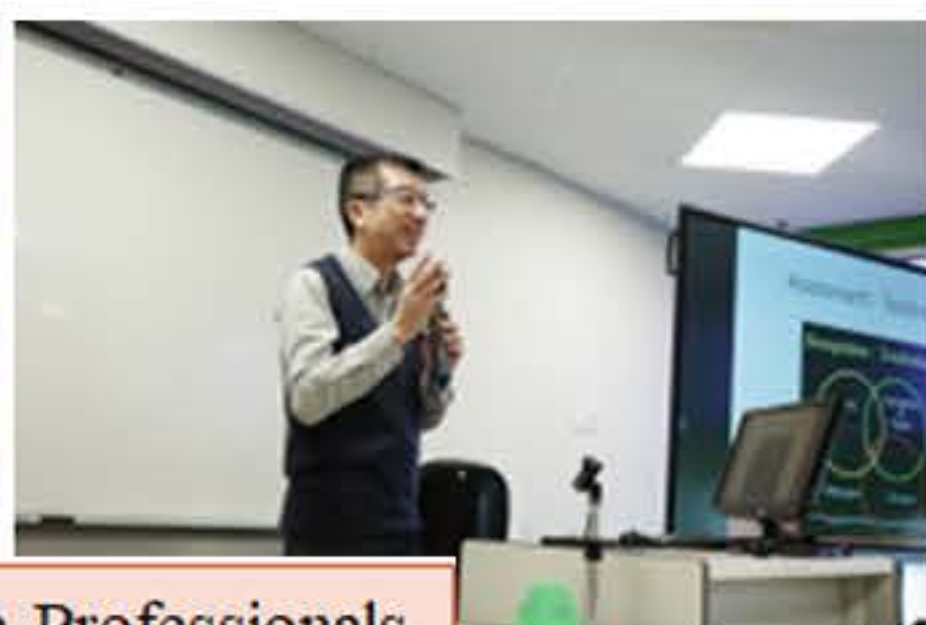
Emergency Medicine Extended Care for Healthcare Professionals