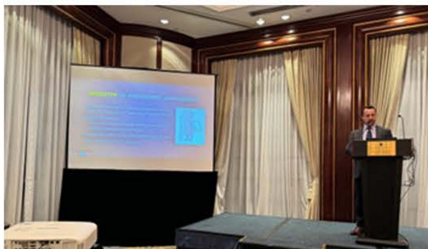
The Value of the Syndromic Approach used at point of care in the Emergency Department