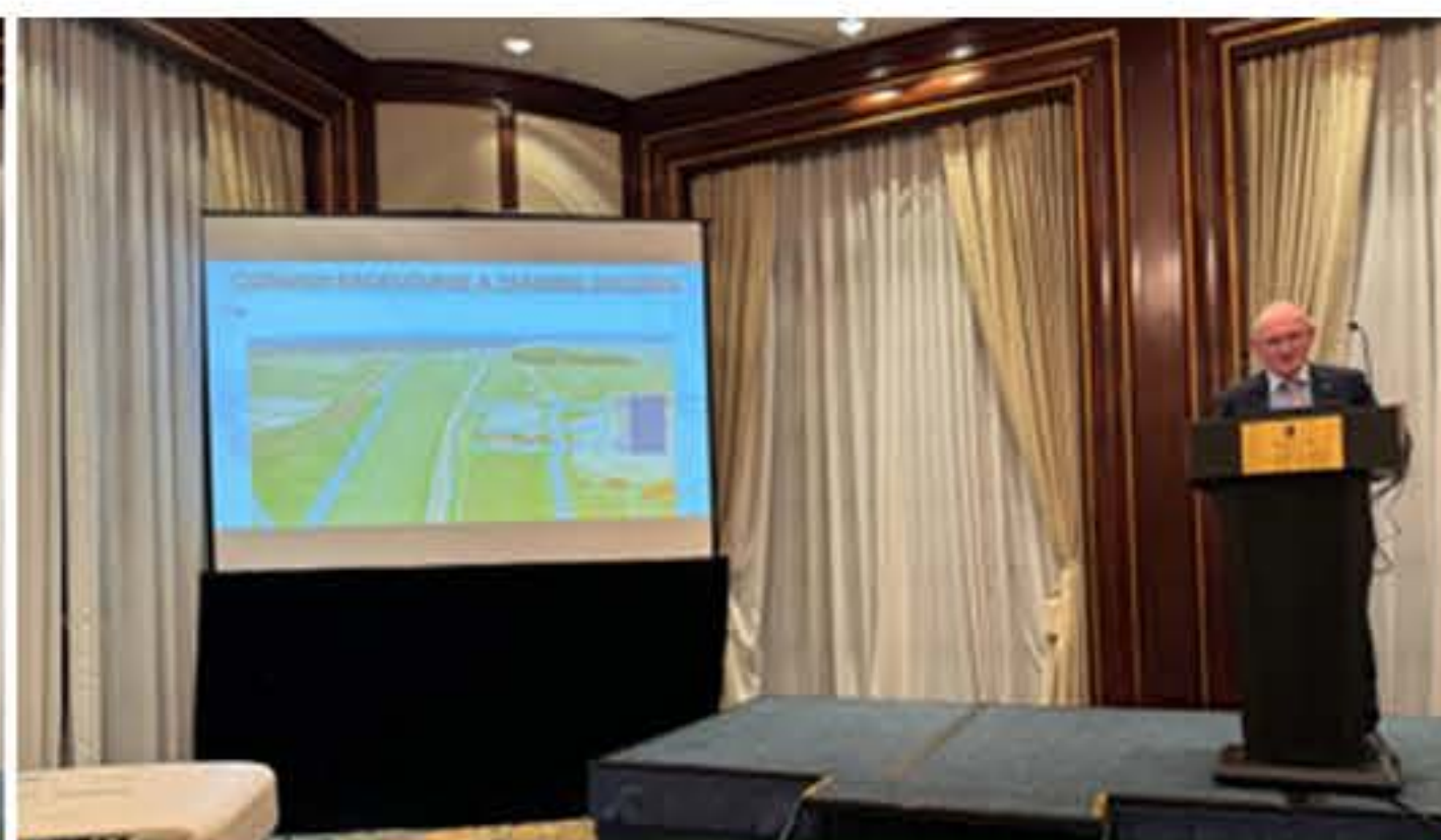
My Career as a Racecourse Medical Officer 1982-2023