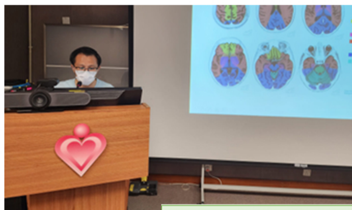
Discussion on OSCE by AED, TSWH