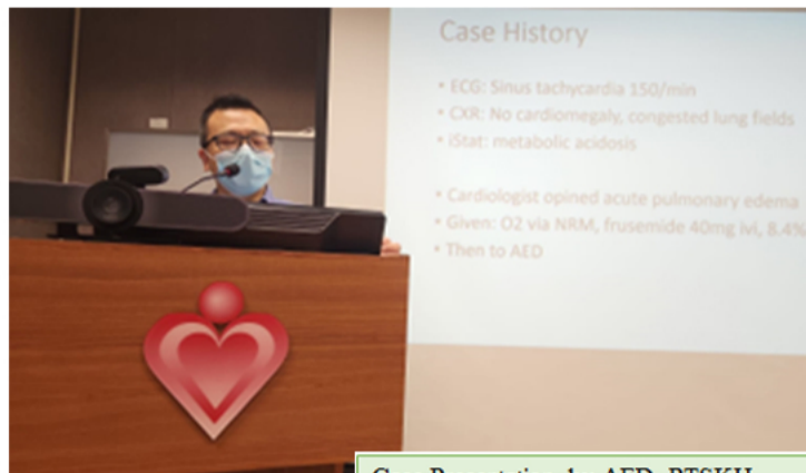
Case Presentation by AED, RTSKH