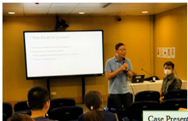
Case Presentation by AED, PYNEH