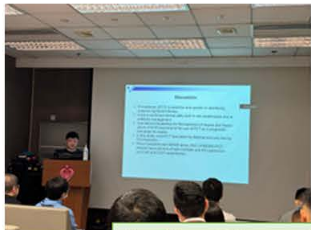
Case Presentation cum Research Session by AED, KWH