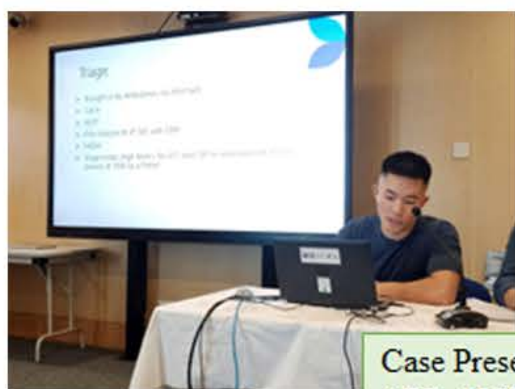
Case Presentation by AED, YCH