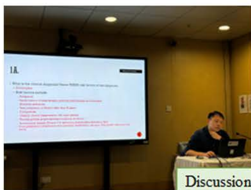
Discussion on OSCE by AED, QEH