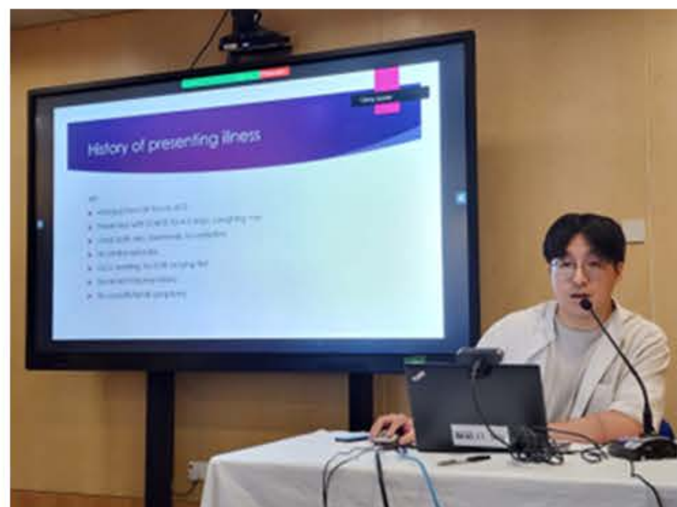
Case Presentation by AED, AHNH