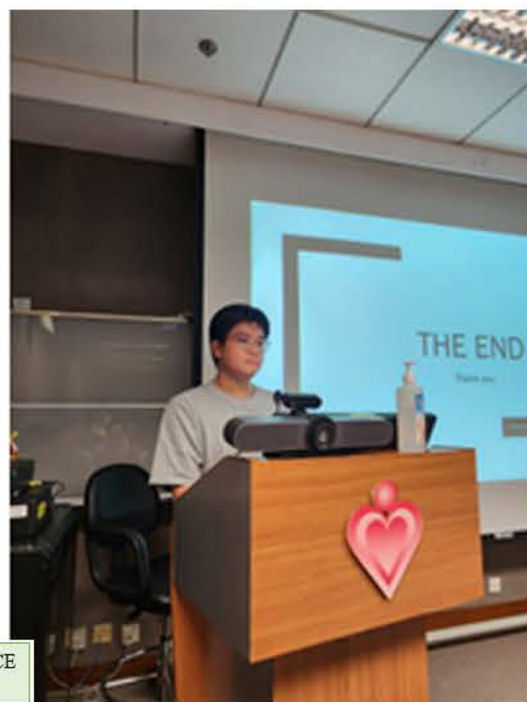
Discussion on OSCE by AED, UH