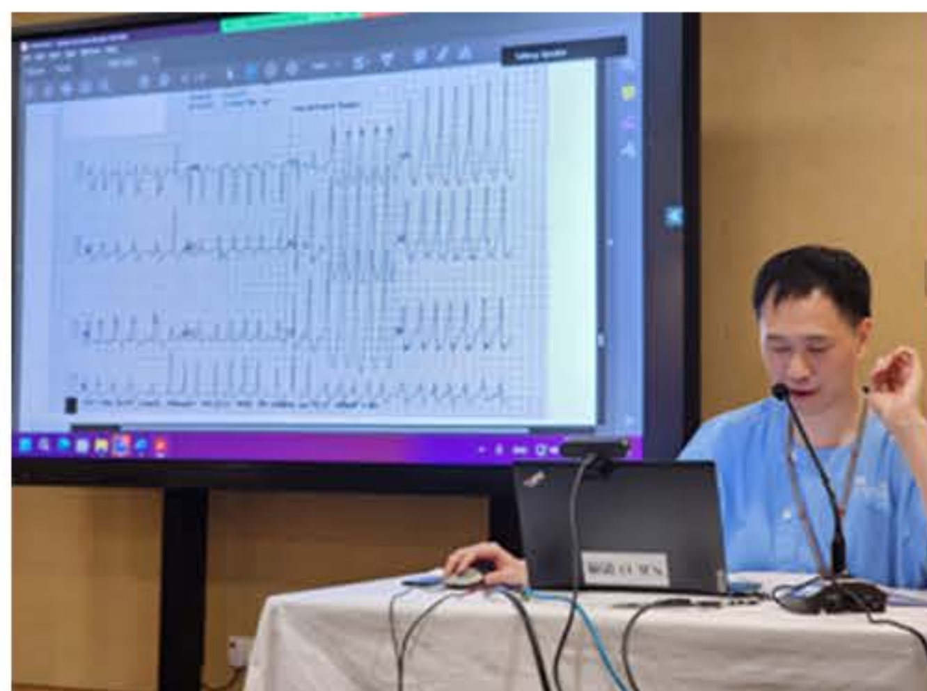
Discussion on OSCE by AED, PMH