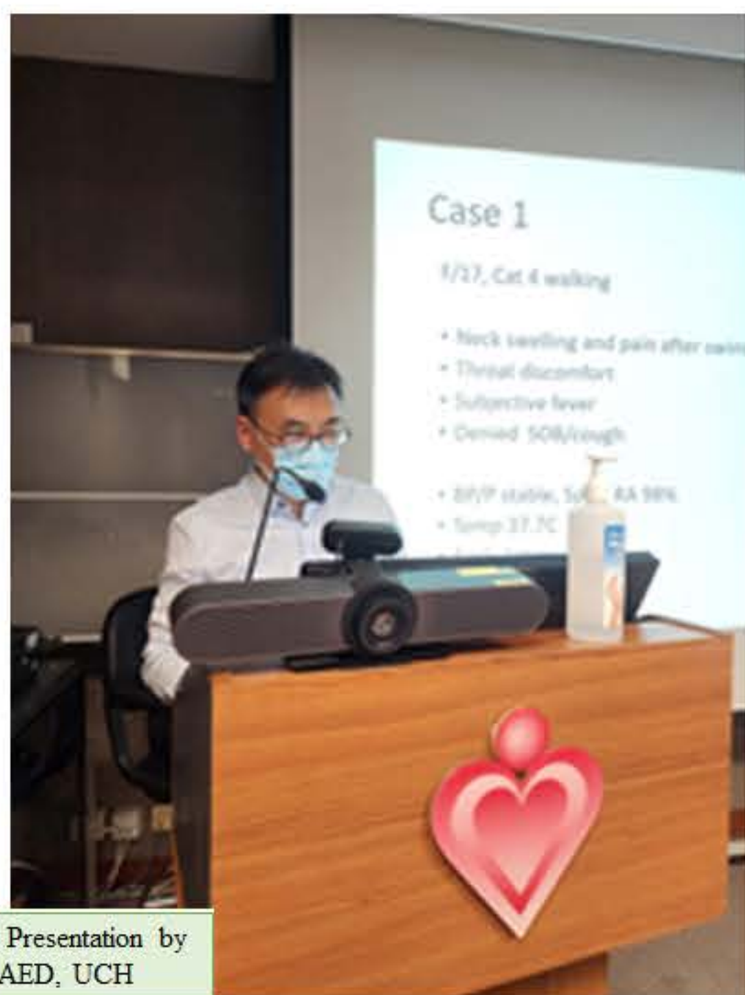
Case Presentation by AED, UCH